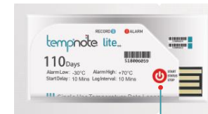
Press Button for 5 Seconds