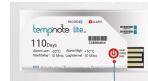
Press Button for 5 Seconds